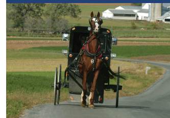
Experience the Amish lifestyle

Departure: High Point Senior Center, 600 N Hamilton St, High Point, NC @ 8 am