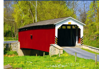
View Lancaster's picturesque landscape