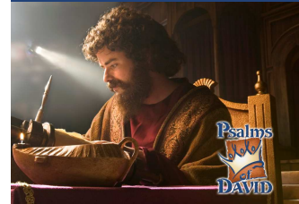
See "PSALMS OF DAVID" at the Living Waters Theatre®